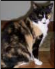
Sweet Momma Kitty